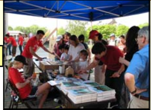
A crowd gathers at the PSLA exhibit outside the Plant Sciences Building on Maryland Day